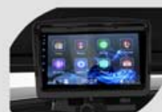
9" Bluetooth Touchscreen W/Back- up Camera