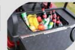
Folding Rear Seat Trunk & Holder