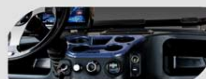
USB Socket + 12V Power Outlet Color matched dashboard