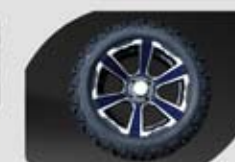
14" Color Matched Off Road Tire