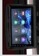
9" bluetooth touchscreen w/back-up camera