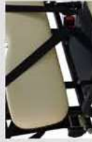
E-mark three point seat belts