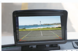
9 inch touchscreen with back-up camera