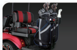
Optional golf bag attachment & sand bottle kit