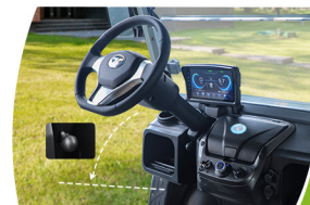
Adjustable steering column