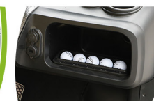
Storage compartment with golf ball & tee holder