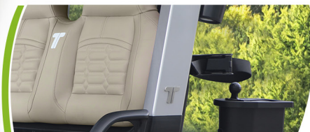
Aluminum Canopy Supports