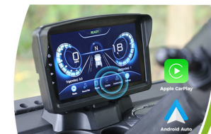
9" Touchscreen with carplay compatibility