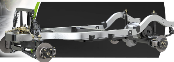
Aluminum Chassis & Hydraulic Brakes