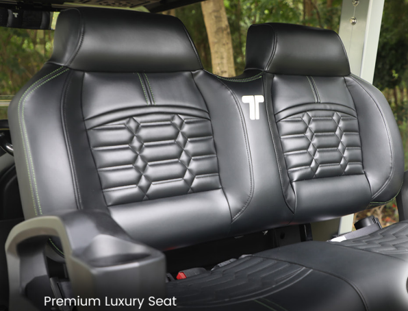
Premium Luxury Seat