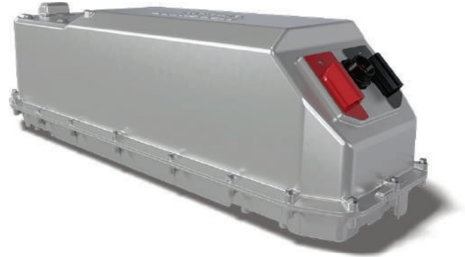
Battery Capacity Years in Service